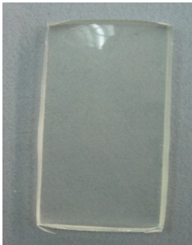
S01Polyurethane AB glue sp01 (initial testing)

Applicant : XIAMEN UGUARD COMPOSITE MATERIALS CO.,LTD. W804, Taiwan S&T Enterprise Incubation Center, Torch high-tech Zone, Xiang'an, Xiamen, China. Attn : Mr.tong Sample Receiving Date : Dec 21, 2012 Testing Period : Dec 21, 2012 to Dec 26, 2012 Sample Description : Polyurethane AB glue sp01 Submitted Sample: